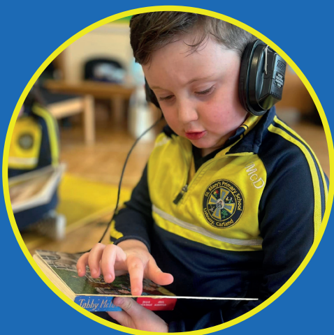
Key Stage 1 - Primary 3 & 4