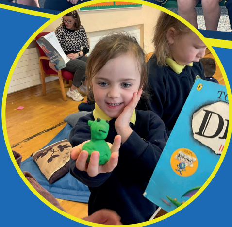
Foundation Stage - Primary 1 & 2