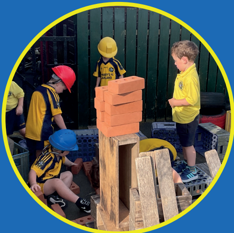
Key Stage 2 - Primary 5, 6 & 7