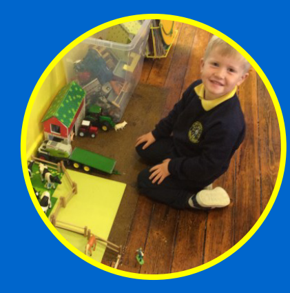
Key Stage 1 - Primary 3 & 4