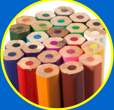
Foundation Stage - Primary 1 & 2