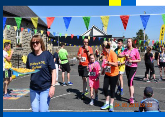
We promote a sense of community.