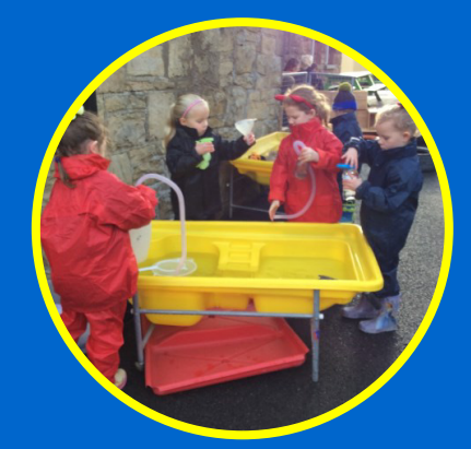
Key Stage 2 -Primary 5, 6 & 7