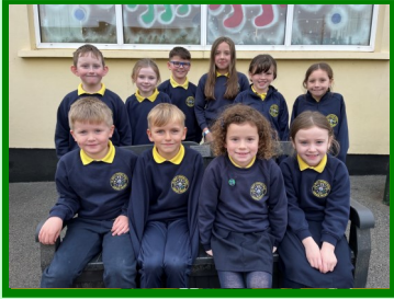
St. Mary's 'Eco team' for 2022-23: