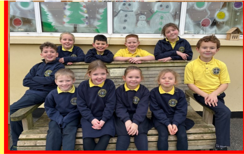
Meet our 'School Council' for 2022-23: